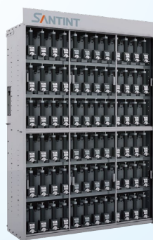
■ Heated Cabinet

■ Pump Configuration: Piston pump ■ Toner Type: Water based/Solvent based