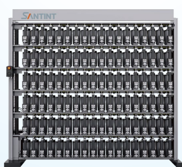
■ Mixing Machine