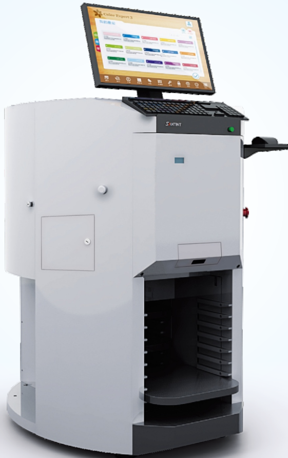
● Manual Can Table Version